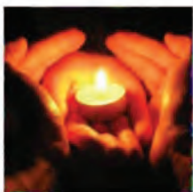
Light a Candle Enciende una vela

Nov. 6, 2020 FIRST FRIDAY OF FIRE Nov. 6, 2020 PRIMER VIERNES DE FUEGO