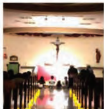
Say a prayer Haz una oración